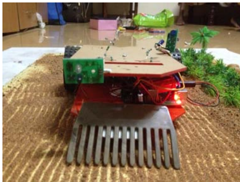
Fig 1: Arduino Board

It is a embedded system where we involving by connecting system hardware with software in real time environment it's an open source software easy to program up with different applications. 9 V power supply required to the board which will be shared all over the circuit board for example sensors LED displayer etc. The main component which is the heart of this circuit board is controller(Atmega) Atmega8 is controller which is manufacture by Atmel Labs Consists of 16 pins